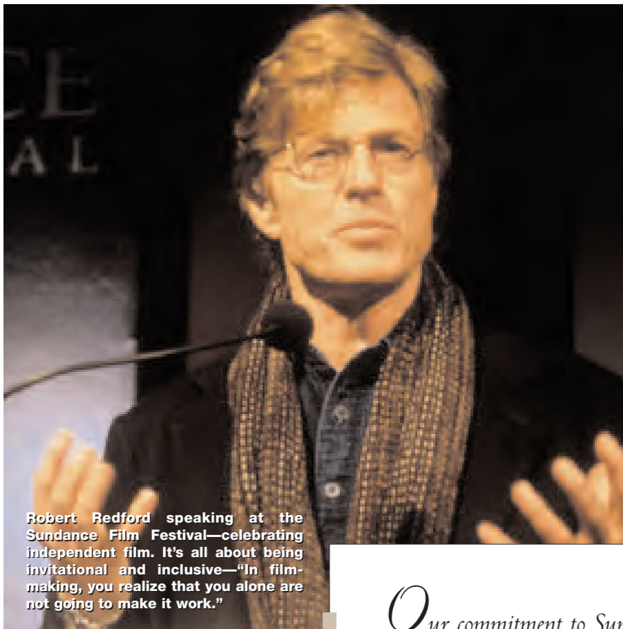
Robert Redford speaking at the Sundance Film Festival—celebrating independent film. It's all about being invitational and inclusive—"In filmmaking, you realize that you alone are not going to make it work."

Our commitment to Sundance has always been to develop very little and to preserve a great deal.