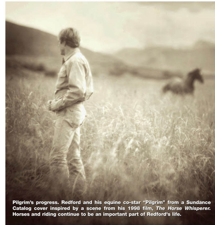
Pilgrim's progress. Redford and his equine co-star "Pilgrim" from a Sundance Catalog cover inspired by a scene from his 1998 film, The Horse Whisperer . Horses and riding continue to be an important part of Redford's life.

Redford is pleased with this lattice approach. "We have versions of these programs in labs forming all over the world," he says. "We're in almost every country, extending the Sundance mission in other areas. We've become kind of a cultural exchange program, and because of our interest in the West, it stays at the center of our image. Sundance—in all of its parts, including the catalog—honors the artist and the audience. It's fundamental to our identity that we work for both sides so that the artist gets a chance, an opportunity, to have a place to develop and then have a place for the work to be shown to an audience. That's why we have started looking at new ways of distribution and exhibition. The Festival gives a chance for viewing, the Channel another. But for many good films it's not enough. So we're starting something called the Sundance Film Series that will take films to a number of cities across the country. We select four films that did not get distribution, didn't get picked up, missed the glare or the buzz but that we feel are good films and should be seen.